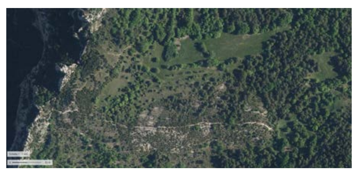
More activities under see-project.eu